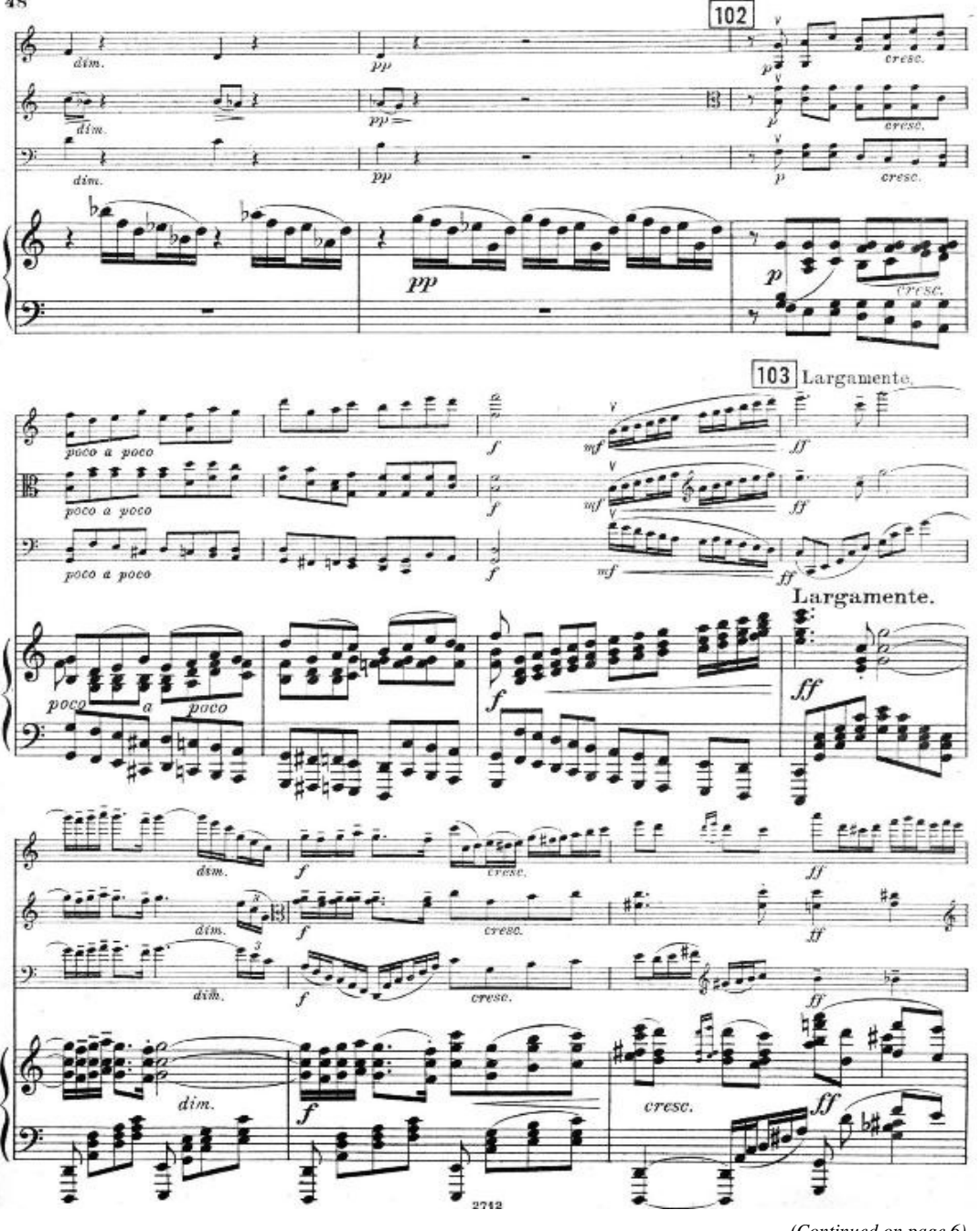
(Continued on page 6)

The Finale, Allegro molto starts by displaying Sonata tendencies, with edgy, dancing melodies, a clearly defined contrasting subject and significant structural pauses. Taneyev's mastery of counterpoint can be seen in this